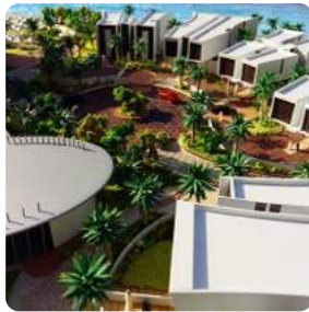
Hotel & Resorts