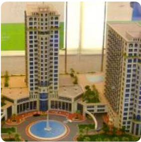
Towers & Villas

Our services offer wide range of 3D productions and printings tailored to your requirements.